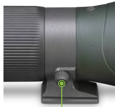
Mounting Collar Thumb Screw